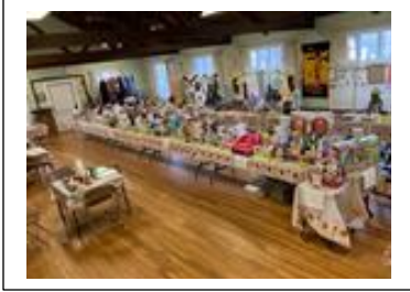
Ready to Open!